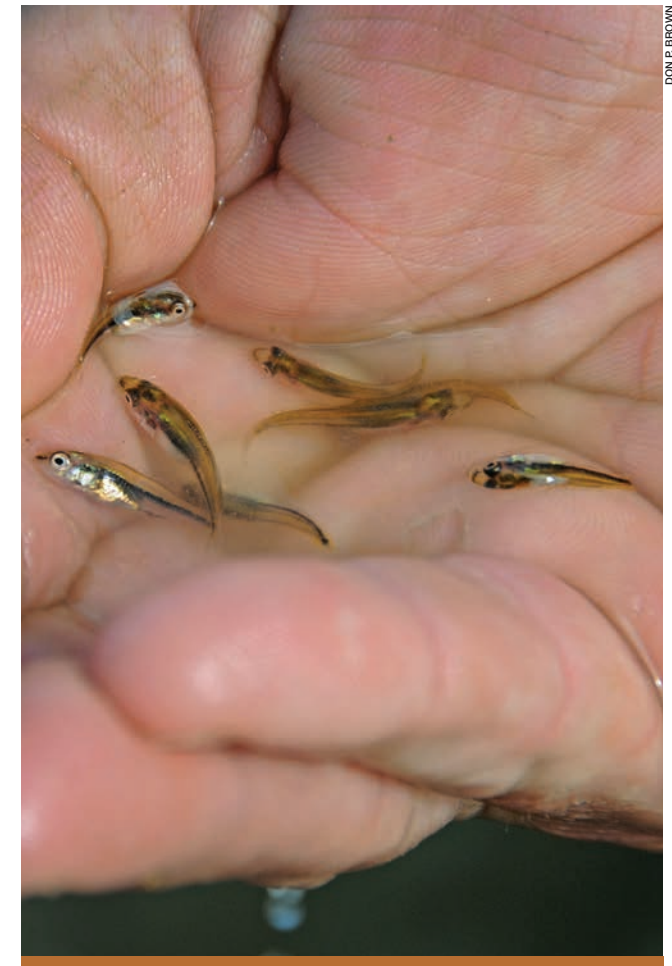
At the time they are collected, the Florida bass fry are about threefourths of an inch in length.

When other personnel were in place, Kildow used a moveable aluminum screen to push the fry into one end of the basin. Small nets were used to scoop up the fry and put them into buckets