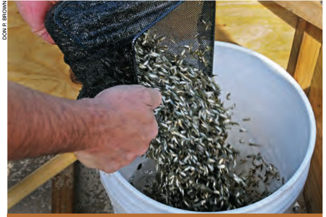
Based on previously taken samples, the bass fry are put into buckets and weighed to determine how many are being loaded into each pond for producing fingerlings.

that held a measured amount of water. The fry buckets were then weighed, allowing workers to keep track of the number of fry that are being removed and placed into a hatchery truck holding tank.