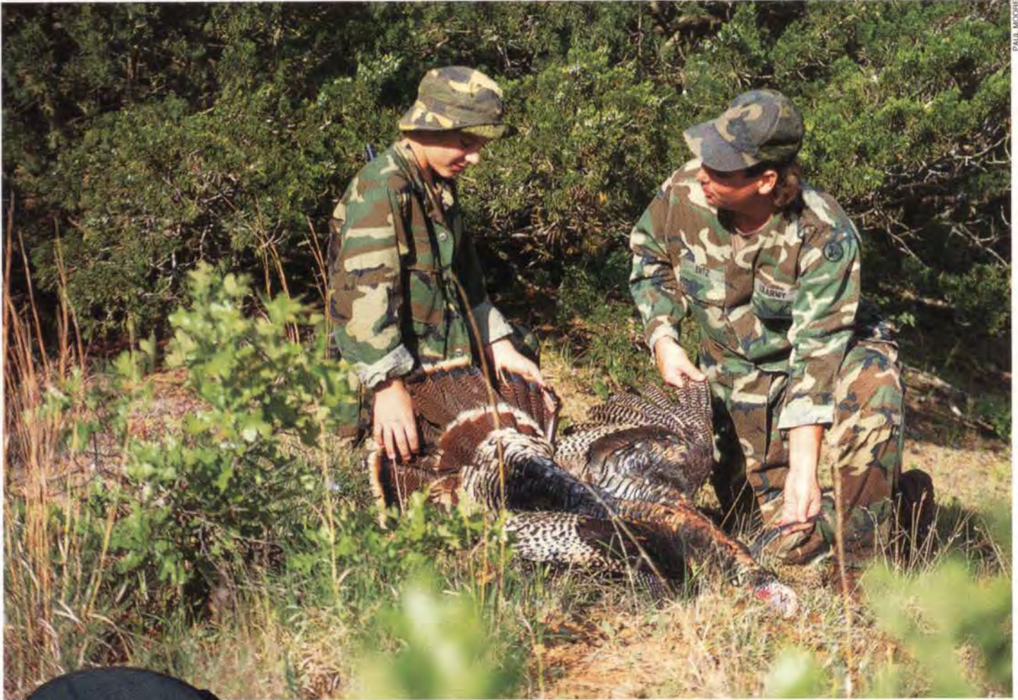
Calling a gobbler in for your son is perhaps one of the greatest events in a seasoned hunter's life. Getting to this point takes teaching, patience and practice – all of which provide quality time together for both father and son.