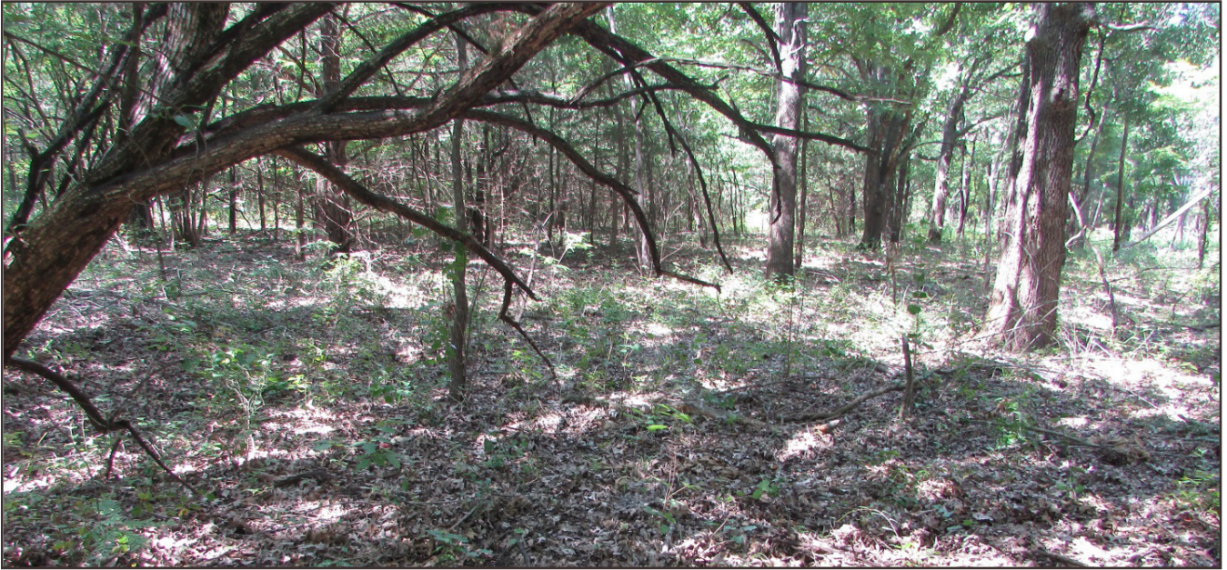
Forests too dense with tree cover fail to offer the year-round food resources that white-tailed deer, wild turkey, and many other wildlife species require.

Contact information for ODWC Private Lands staff can be found on Page 2 of this newsletter.