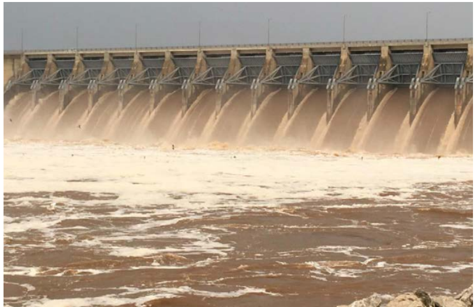
Keystone Dam near Sand Springs - May 23, 2019

Enormous changes to the terrain occurred including the removal of entire sections of river banks along with creek channels being moved or totally filled in. Major amounts of shoreline sloughing and undercutting also took