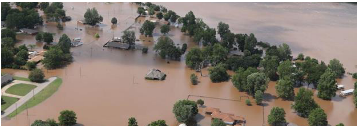
Arkansas River at Sand Springs May 2019

for the betterment of the environment. Aquatic communities do recover by becoming more balanced, abundant and productive. Flood events have happened for millennia shaping the topography and regions we live in today. These will continue to go on and man can only learn to control / cope with them the best he can. Mother Nature, global warming or just bad luck we are all just part of a bigger picture and human habitation is at the mercy of it all.