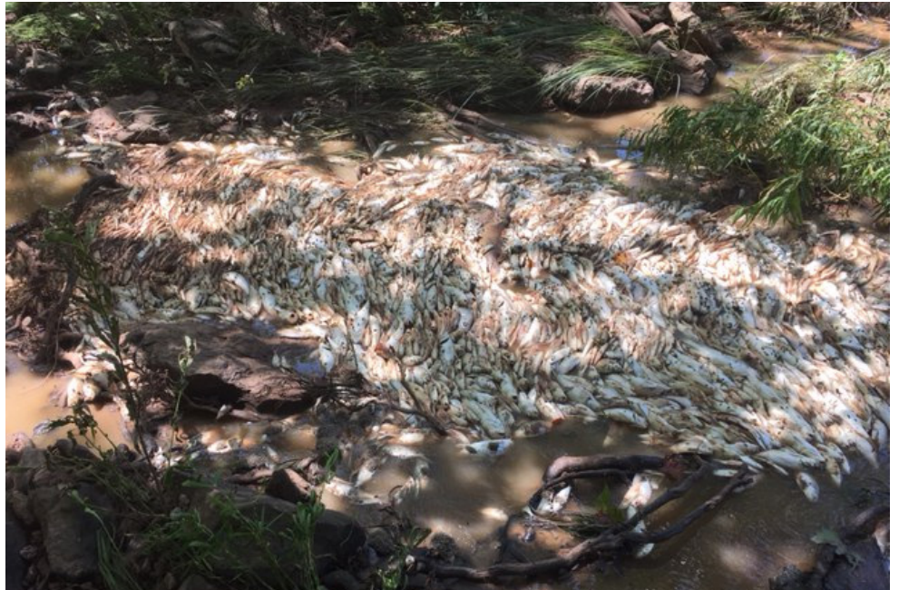
Fish kill after Cushing Lake dam breach due to flood.

Ponds and lakes were filled to their brims. In many cases, this was a needed occurrence in order to flush out old debris and accumulated sediment.