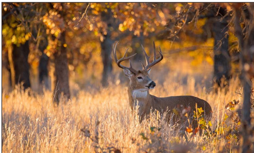
Thinned woodlands restore plant diversity and provide habitat for deer, turkey, and many other birds and mammals. (ODWC)

Today, many of Oklahoma’s once-abundant open woodlands