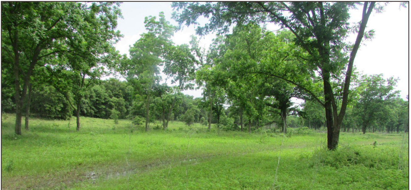
Food diversity for white-tailed deer and wild turkey can be greatly enhanced through timber stand improvements which open the tree canopy and allow abundant sunlight to reach the forest floor.