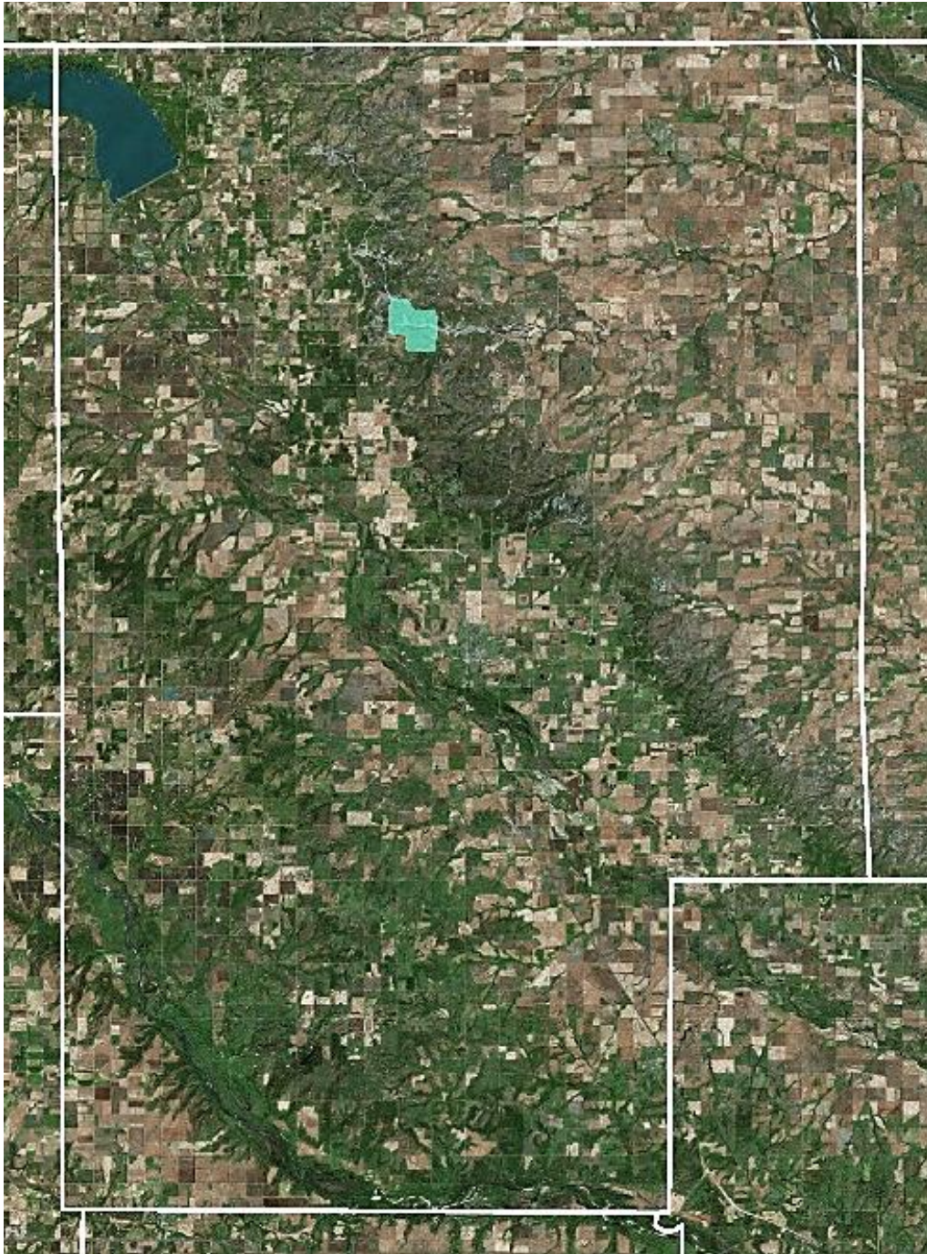
Figure 1. Map of Blaine County, OK, showing location of the Salt Creek Canyon site.