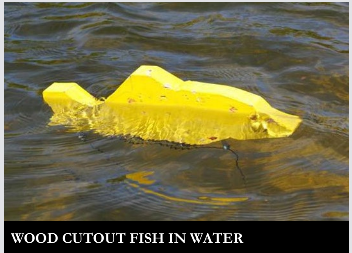
WOOD CUTOUT FISH IN WATER