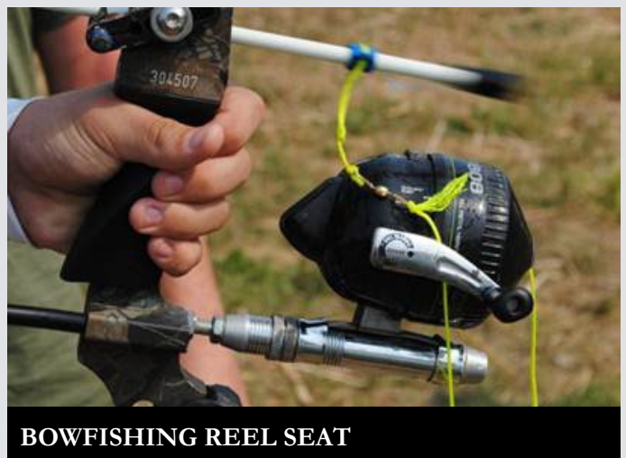
BOWFISHING REEL SEAT