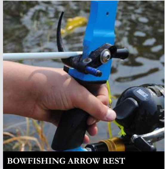
BOWFISHING ARROW REST