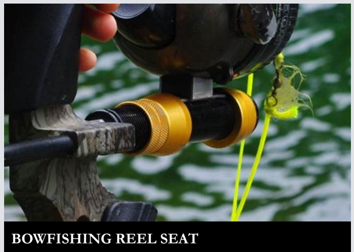
BOWFISHING REEL SEAT