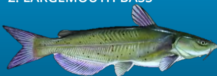
3. CHANNEL CATFISH

Oklahoma anglers fished in lakes most often.