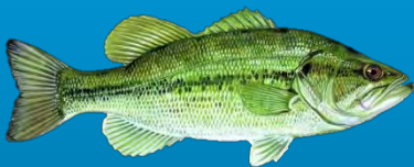
2. LARGEMOUTH BASS

Oklahoma anglers fished in lakes most often.