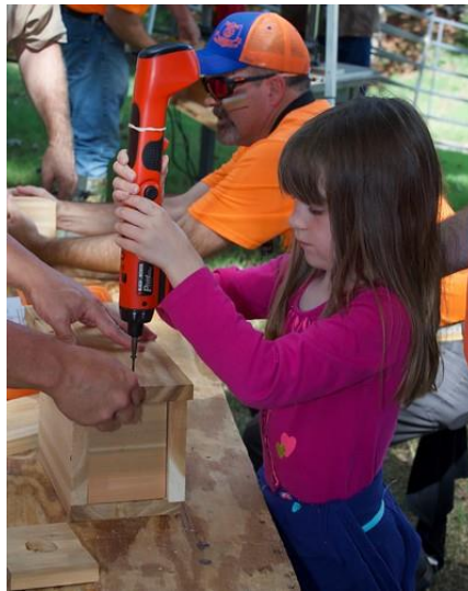
Then the construction begins!