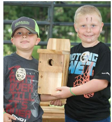
Happy families ready to participate in bluebird conservation!