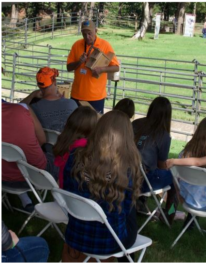
Families first learn about bluebirds & how to monitor the nest boxes.