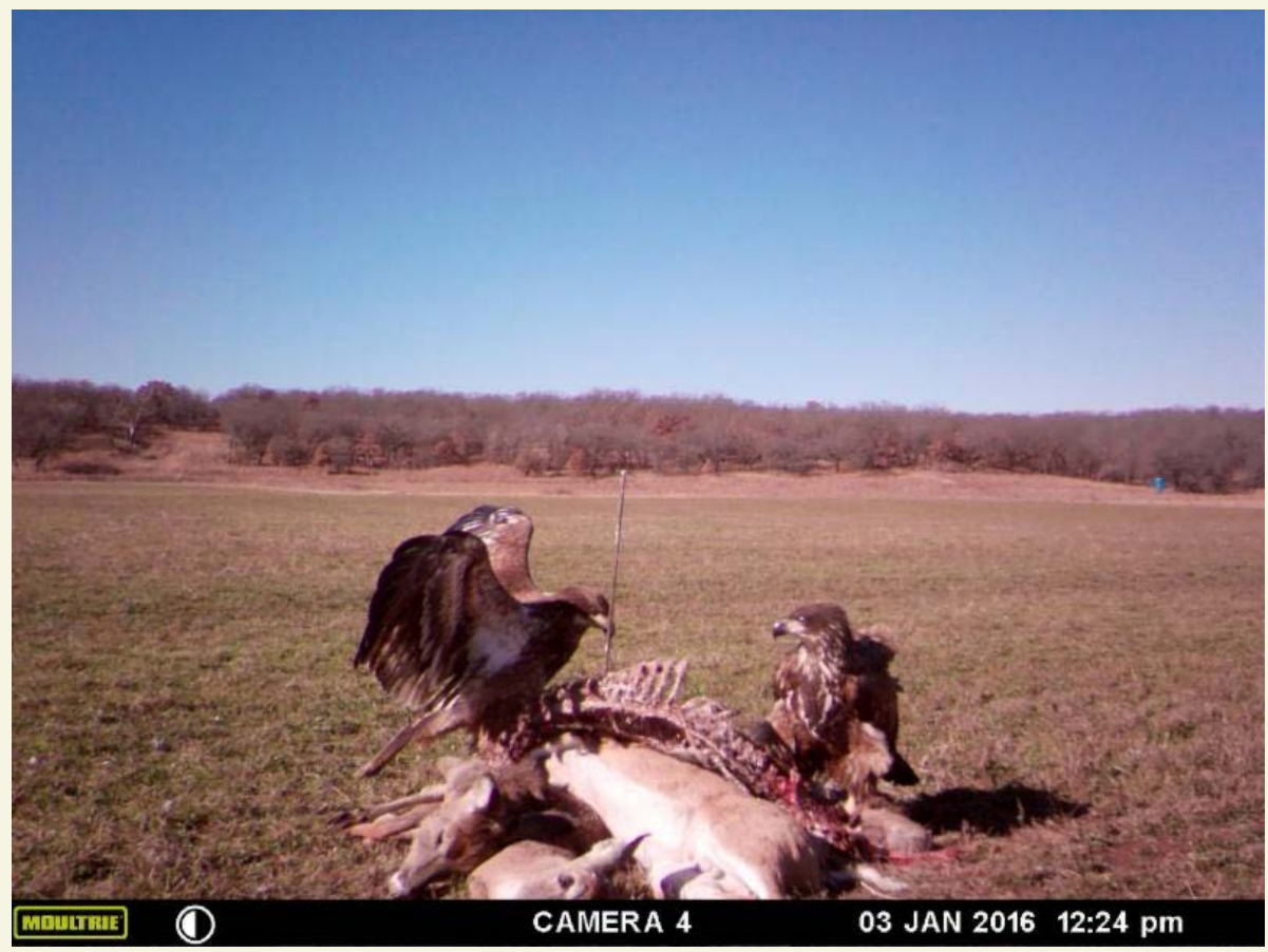
Two immature bald eagles visit the bait station on Jan. 3.