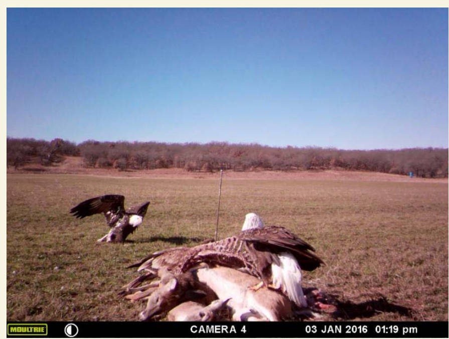
Two adult bald eagles visited one of the project's study areas on Jan. 3.

This winter, Wildlife Department biologists are joining forces with the capture a small number