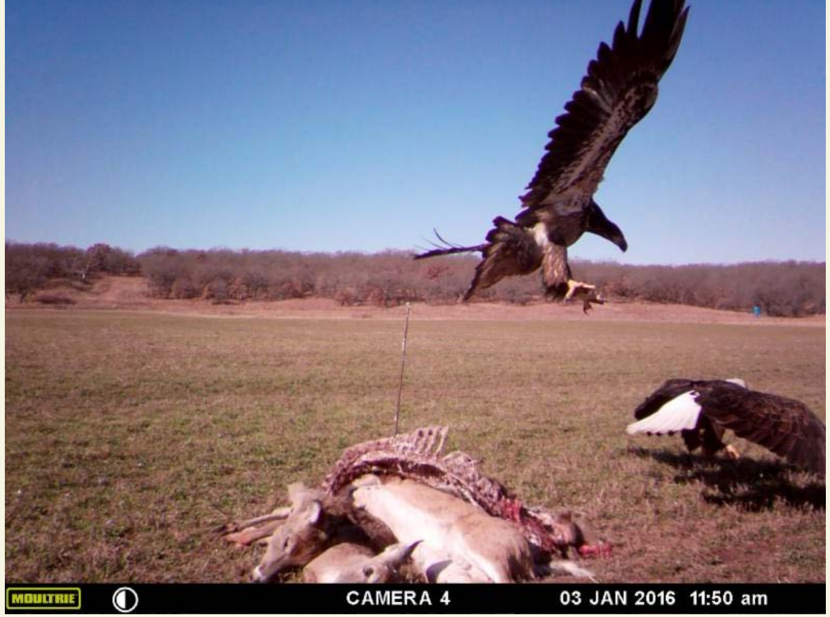
An immature bald eagle (left) flies over the bait station as an adult eagle (right) retreats.