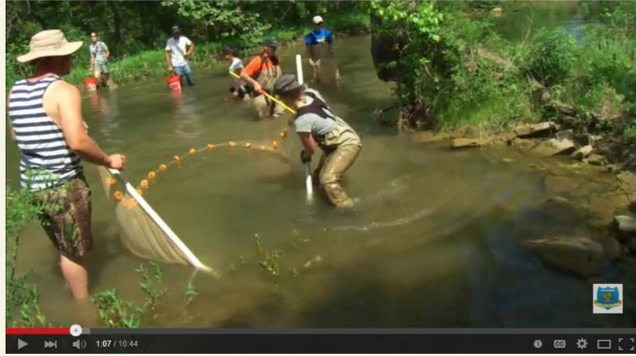
Follow Wildlife Department biologists as they help with The Nature Conservancy's stream monitoring program.