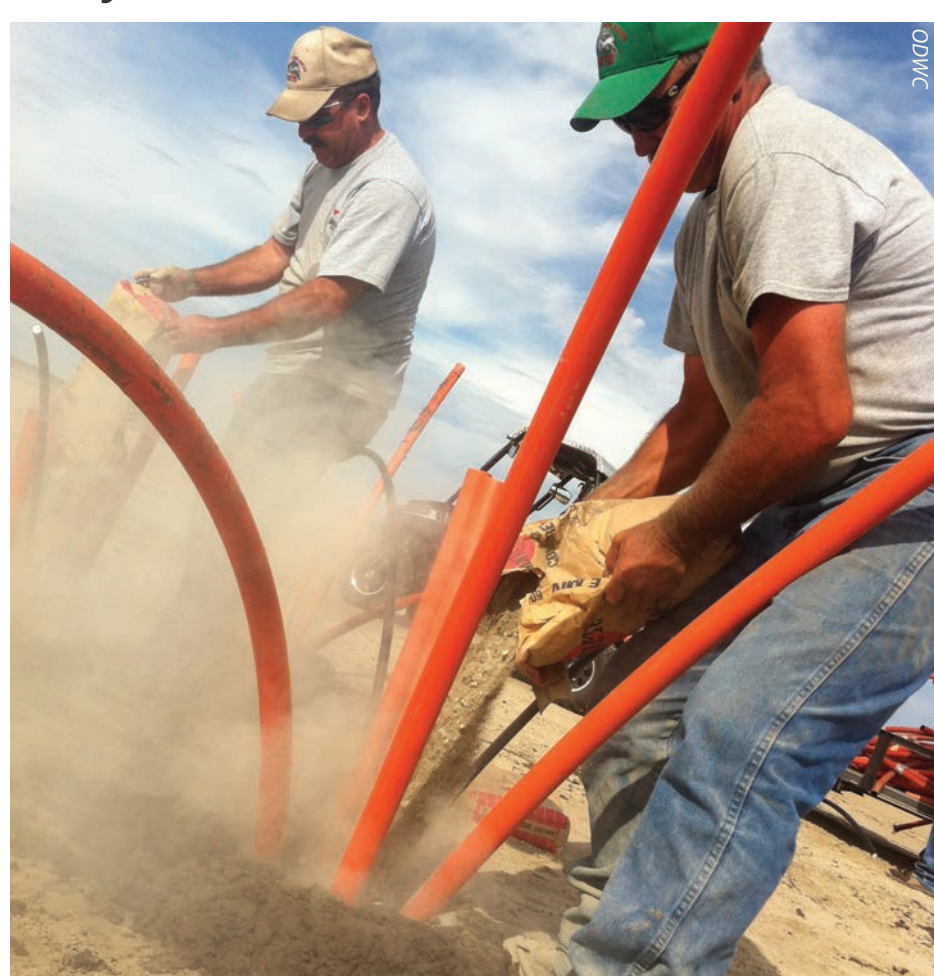
Artificial structures like PVC trees provide great fish habitat.

Natural items like cut trees, aquatic plants, gravel piles and dirt mounds all work well for boosting your pond's shelter. They are a little more laborinvolved but create plenty of nooks and crannies for aquatic