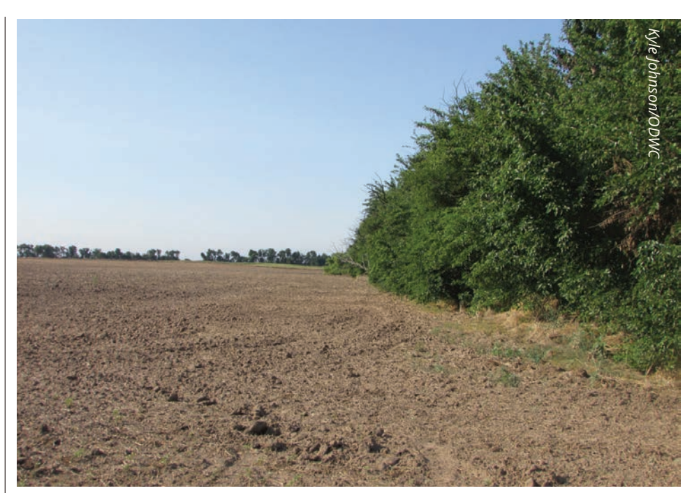
When croplands abruptly meet forested areas, habitat for quail and other wildlife is minimal. Woodland borders like this can be greatly enhanced through edge feathering practices.

The value of edge habitat for wildlife has been advocated for many years, but these transitions between two habitat types are not always suitable for quail and other species. All too often, the borders that exist between grasslands and woodlands or croplands and woodlands are abrupt and lack the diversity required to attract and hold wildlife. In most natural situations, the transition from one habitat type to another is gradual and contains a diverse mix of both habitat types. The