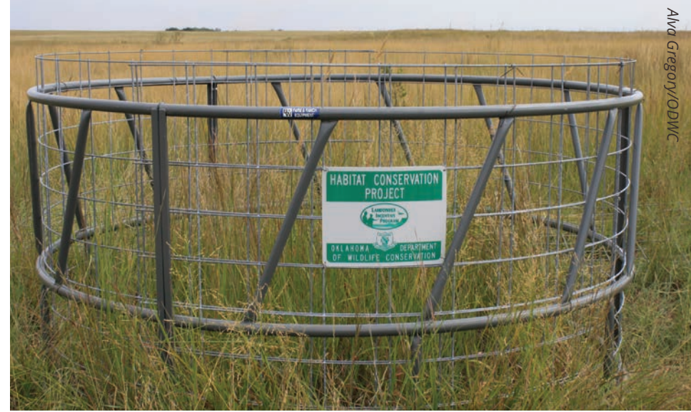
Installing a grazing exclosure, or small pen, that allows grass to grow without pressure helps landowners balance livestock grazing needs with wildlife habitat.

Two to three cattle panels, t-posts and small pieces of wire are the only requirements for creating a grazing exclosure. This exclosure, or small pen, allows the grass inside the pens to grow without any grazing pressure. An empty hay ring can be easily incorporated into the design, providing a more permanent shape for the exclosure. Producers can then compare the amount of grass growing inside