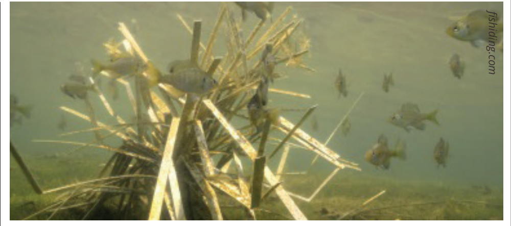
Shelter, or structure, is an important habitat component for fishing ponds or lakes.

essential to growing a healthy pond. Muddy or stained water really hurts your pond's fish production. Because these murky ponds don't allow sunlight to penetrate the water column and substrate, they won't be able to support a lot of food items. This affects all of your primary producers. Suitable pond depths and a clean water source will support your pond's food web. Clean water from run-off, a spring, or creek will help your pond flourish. Street runoff just won't do!