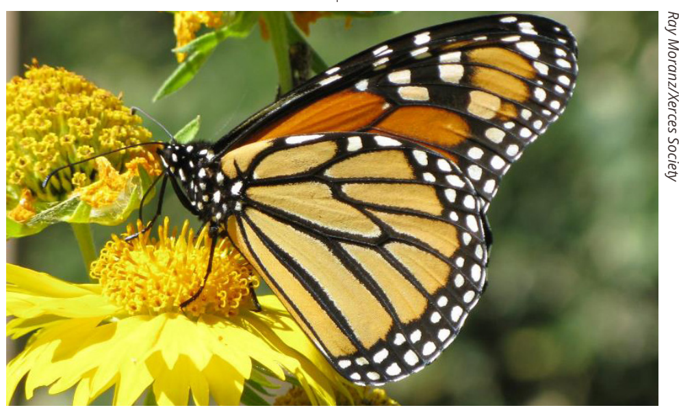
Landowners in the bulk of Oklahoma can help conserve monarchs by planting milkweeds and nectar-rich plants on their property.

Monarch Butterfly Initiative – The monarch has experienced significant population declines over the past two decades. Through Farm Bill conservation programs and technical