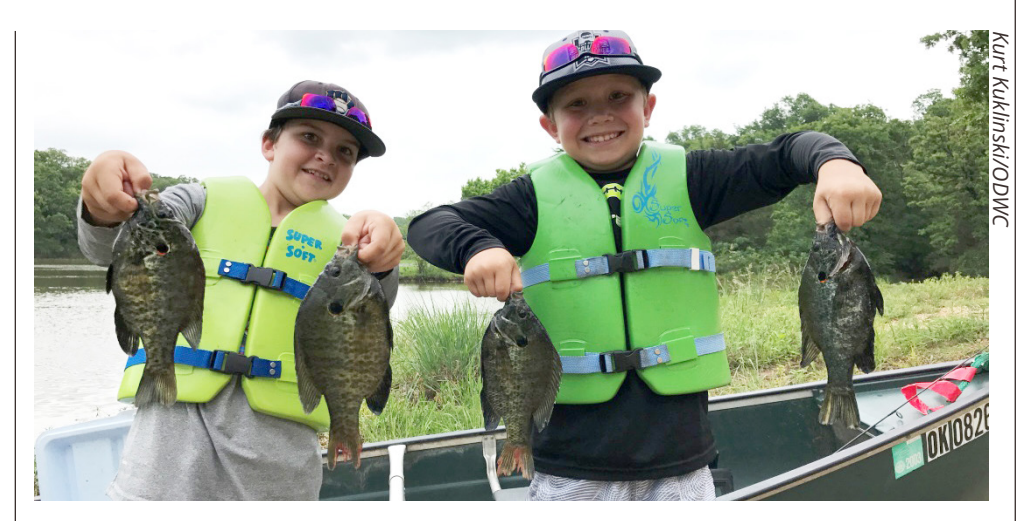
Inviting young anglers to an overcrowded pond may be a solution to your fishery, and for keeping kids active this summer.

One common issue in Oklahoma ponds is overcrowded or stunted bass populations. This simply means too many bass are competing for a limited amount of food, resulting in stunted, or very slow growing bass. In this situation, most bass grow 10 to 12 inches in length, with few individuals obtaining greater lengths. This can be corrected by reducing the total bass population (usually through harvest), but from a young angler's perspective is this really