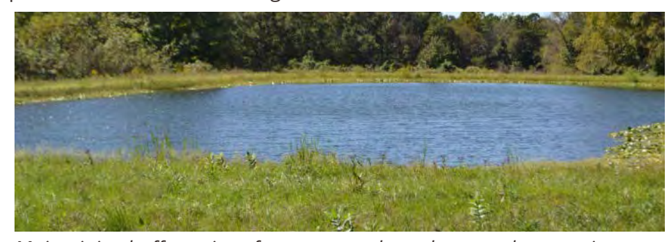
Maintaining buffer strips of grass around ponds can reduce nutrient runoff and prevent summer fish kills.

Controlling aquatic vegetation is another important part of pond management but it can be easy to go overboard. When applying herbicide for vegetation control, break the work into sections. It is recommended to treat only one-quarter of the pond per application allowing a week of rest in between applications. This will help avoid adding too much decaying matter into the pond at once and keep your oxygen in the water for the fish.