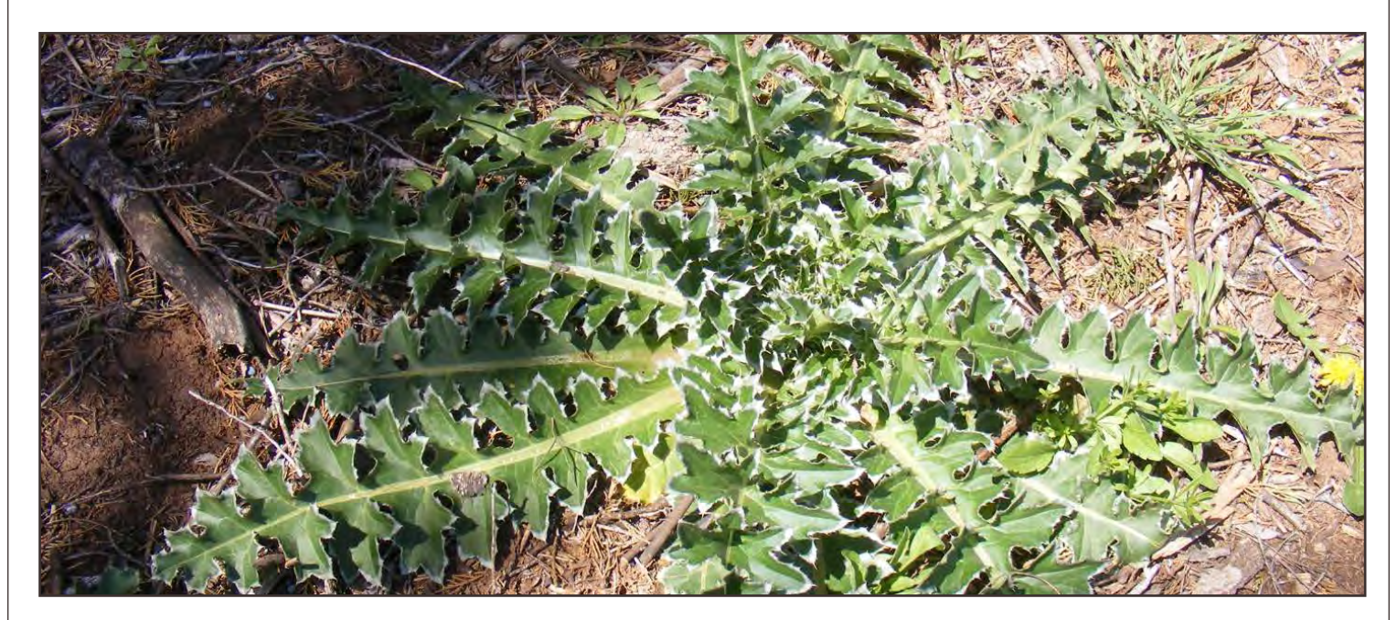
Musk thistle is best controlled with herbicide treatment of young rosettes. Severing the root and mowing are other control options.

healthy plant communities, keeping a watchful eye, and being ready to take action against the musk thistle are proactive measures to help prevent the spread of this weed across the landscape and improve wildlife habitat.