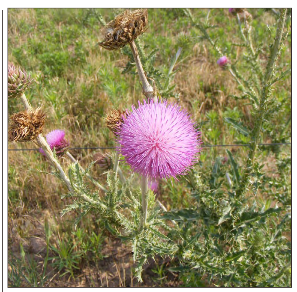
Showy pink to purple flowers and spiny leaves are characteristics of the noxious musk thistle.

Preventing plants from reaching the seed-developing stage is key for managing the spread of this thistle. Although some planteating insects (primarily weevils)