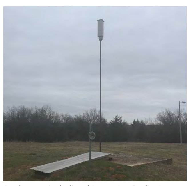
Bat houses, including this new "rocket box" design, are a great way to invite bats to your property.

bat house, pressure-treated wood should be avoided as it contains chemicals that may be toxic to bats. Bats like dry, warm, draft-free houses, so careful caulking and painting are important. In Oklahoma, houses need to be painted a tan or light brown to help absorb a little heat, but not too much. Do not use oil-based products. Do not use metal mesh on landing and inside surfaces as it will tear at the bats wings and feet. Use only UV-resistant plastic