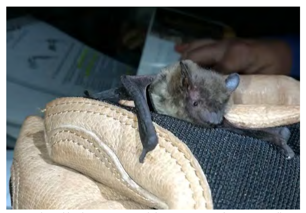
Evening bats, like this one captured during a survey of Cimarron Hills WMA, can be found statewide and accept bat houses.

Construction plans for a rocket box and other bat house designs may be found at <u>batcon.org</u>.