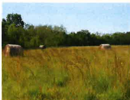
(Right) Native Prairie Restoration

U.S. Fish & Wildlife Service 9014 East 21st Street Tulsa, Oklahoma 74129 918-625-0156 (cell) 918-382-4506 (office) john_hendrix@fws.gov www.fws.gov/southwest/es/oklahoma/