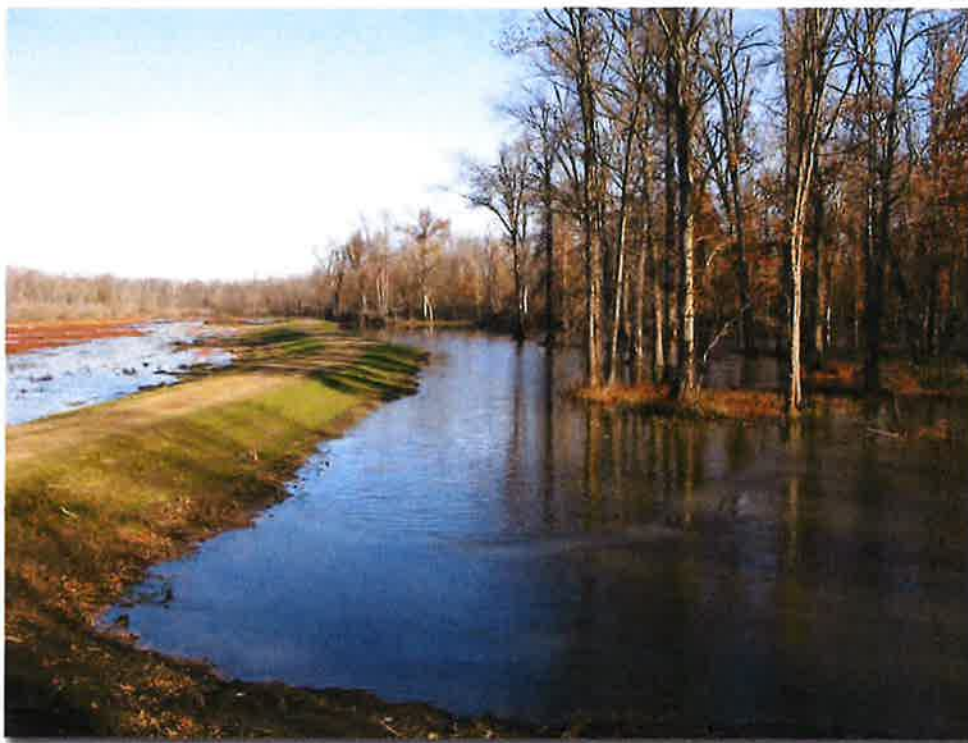
Bottomland Hardwoods Wetland

The U.S. Fish and Wildlife Service is the federal government's lead agency for conserving and managing the nation's fish and wildlife resources. The Partners for Fish and Wildlife Program has been designed to assist private landowners in wildlife habitat restoration and other enhancement activities, including assistance to educational institutions. In Oklahoma, 97 percent of the land is in private ownership. Wetlands and other wildlife habitat on these privately owned lands provide untold potential for restoration and enhancement. Wildlife management projects can fit well with most farming and ranching operations. Technical assistance and financial incentives are available from the FWS to landowners interested in improving the status of wildlife and important habitat on their property.