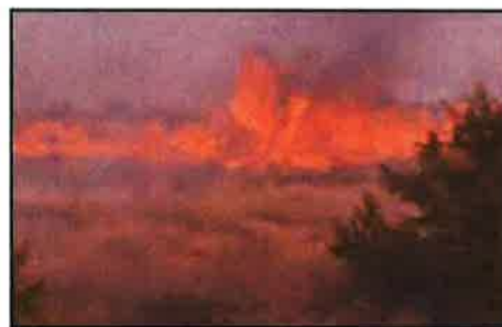
(Above) Total Acres and Project Site Map. (Right) Cedar Removal and Prescribed Fire.