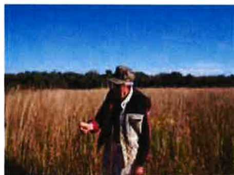
Native Prairie Restoration - After.