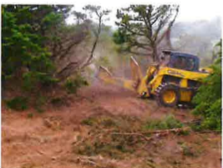
(Above) Native Prairie Restoration.