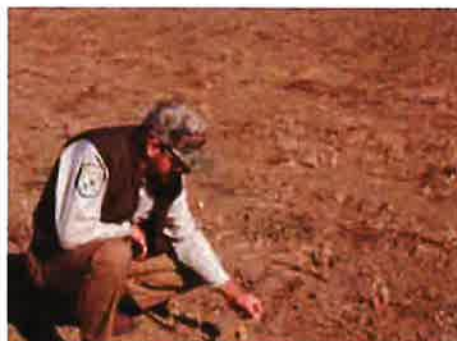
Native Prairie Restoration - Before.