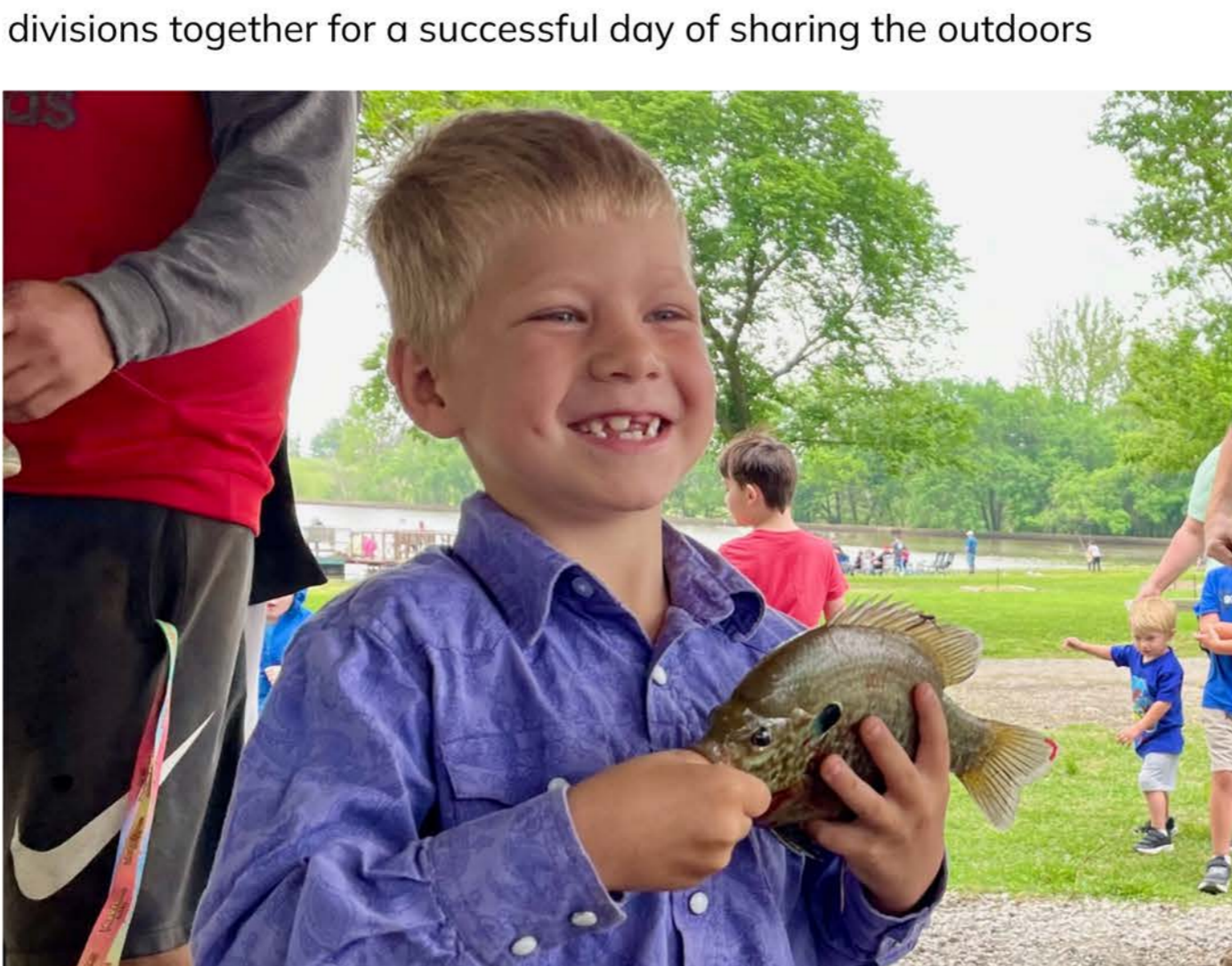
The smile tells you everything you need to know about this event.