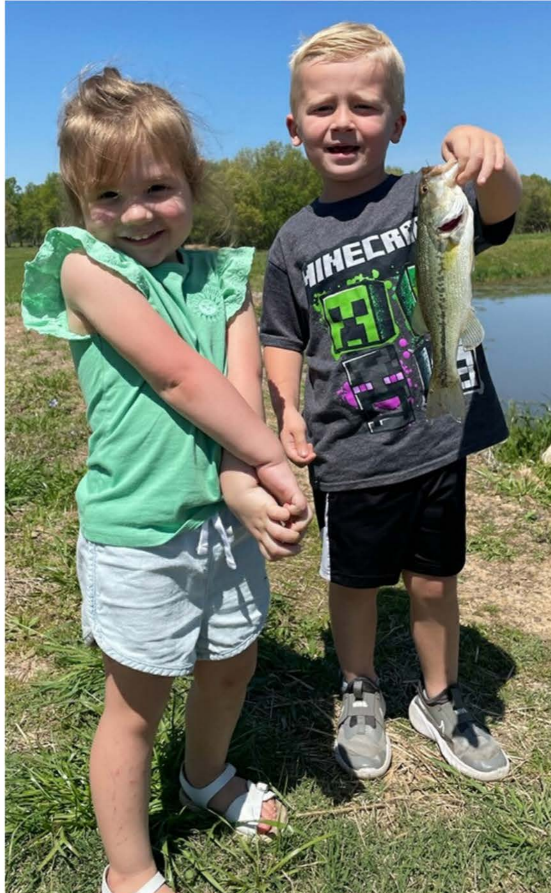
Fishing friends are the best kind of friends!