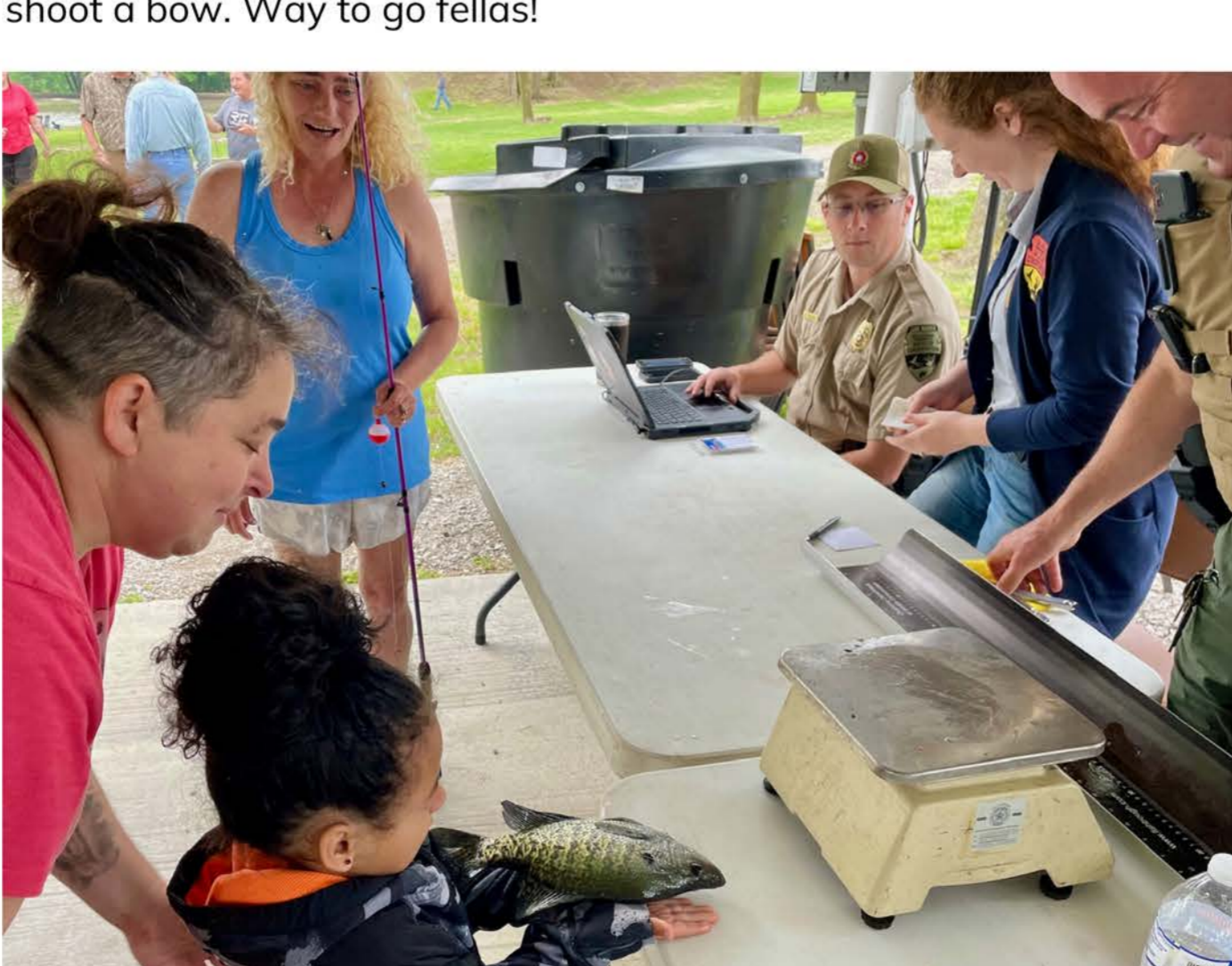
The Bass and Badges event brought ODWC employees from across divisions together for a successful day of sharing the outdoors