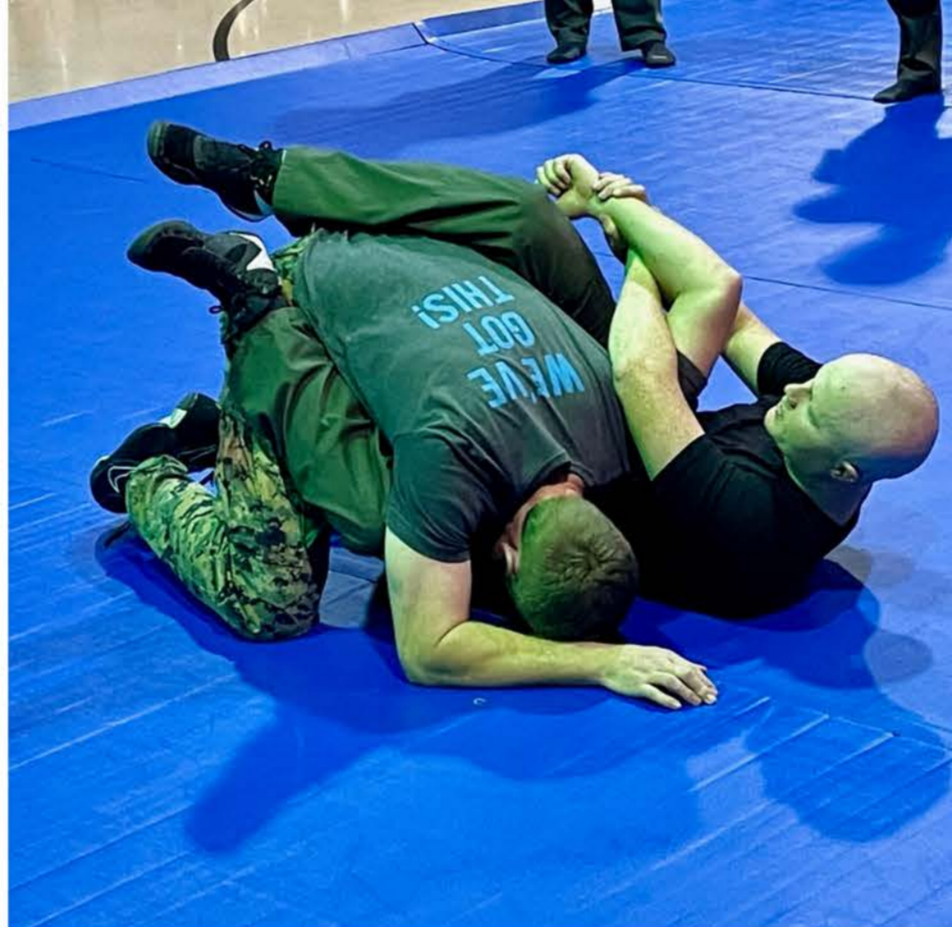
Learning these tactics is crucial for law enforcement. This is a ground law enforcement move. This move keeps the bad guy from getting your gun.