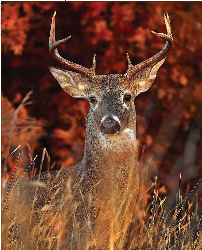
ALAN MCGUCKIN/RFP 2024

You cannot submit more than one application per category. Since applications are completed and submitted online, you will