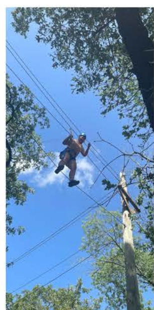
The kids and the counselors all had a great week at camp.