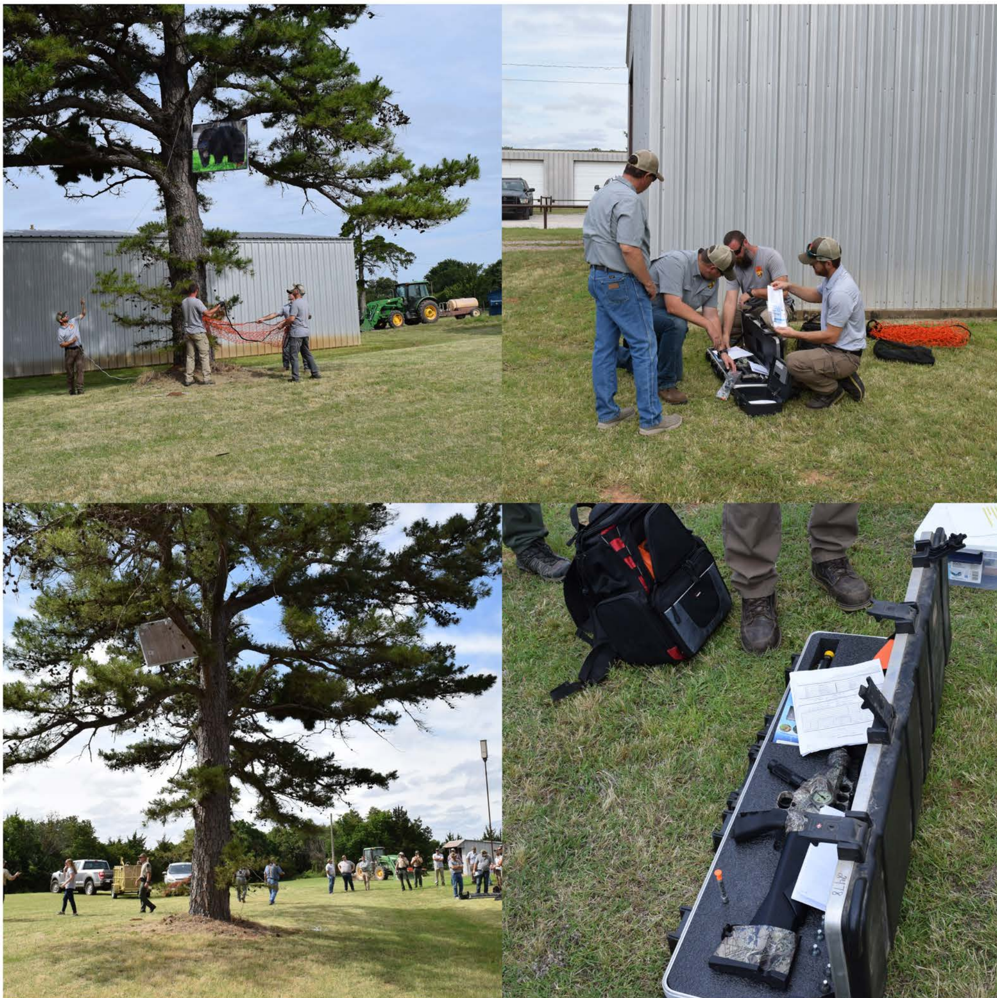
Being prepared is crucial for real life scenarios.

Several ODWC and USFWS employees recently attended a nuisance bear training in northeast Oklahoma. The session provided a comprehensive overview of bear response procedures, with a focus on handling Level 1 bear incidents in urban areas. Level 1 is defined as the bear being an immediate threat to human health and safety. These incidents require an immediate site visit, and the bear may need to be euthenized or tranquilized and relocated. Key topics of the training included BearWise information, the introduction of new sedation drugs, and the distribution of supplies to Nuisance Bear Coordinators (NBCs) across the state. Participants engaged in multiple mock scenarios involving a bear treed in an urban setting, practicing essential skills such as dart loading, crowd control, team communications, collaboration with local law enforcement, safety considerations for darting, and the process of safely removing the bear from the scene. The training also covered drug reversal techniques and strategies for hazing. This hands-on experience was invaluable for NBCs to refine their response tactics and ensure effective management of bear incidents in urban environments.