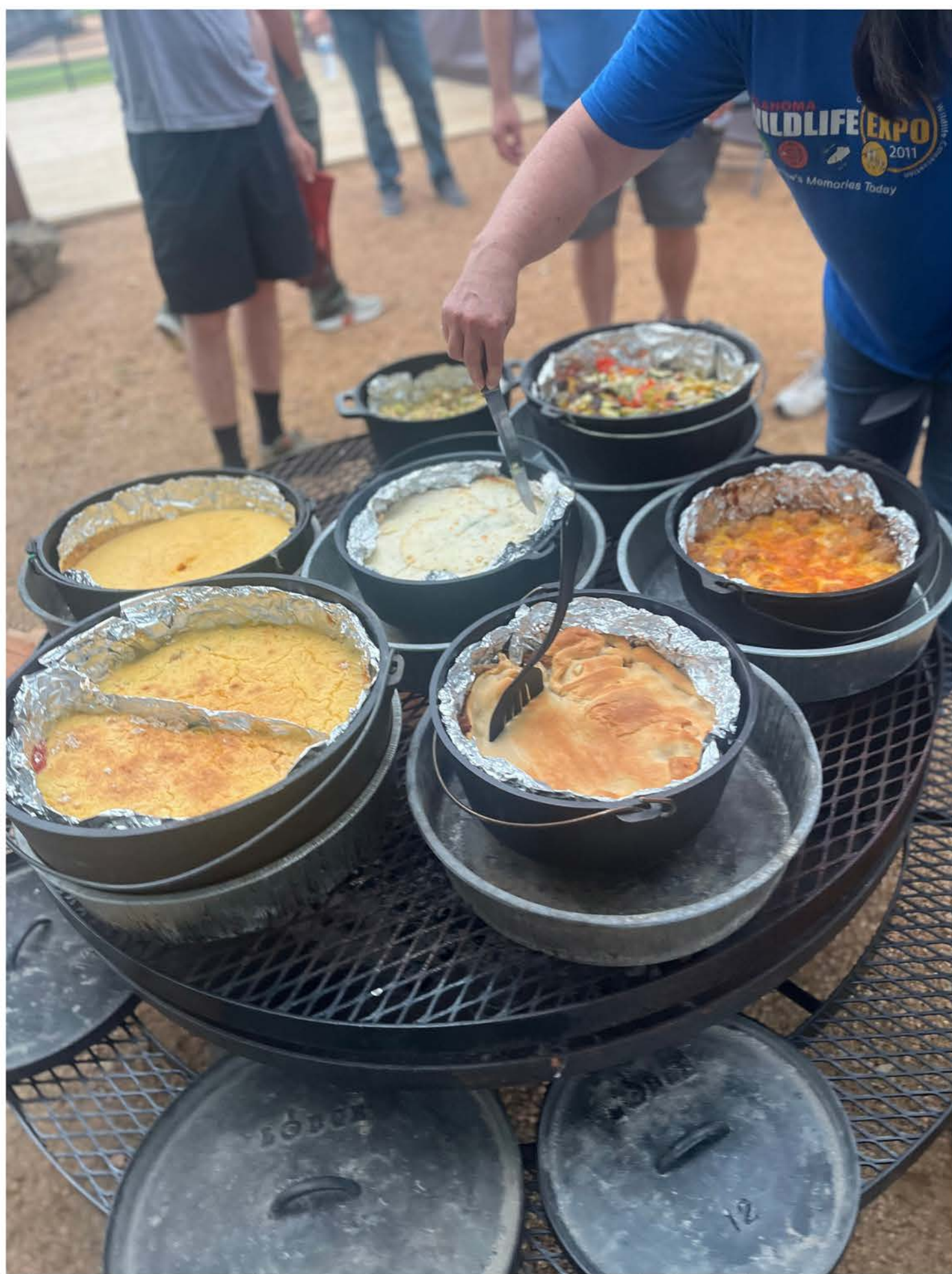
Classmates teamed up to whip up a smorgasbord of Dutch oven delights, ranging from savory to sweet!