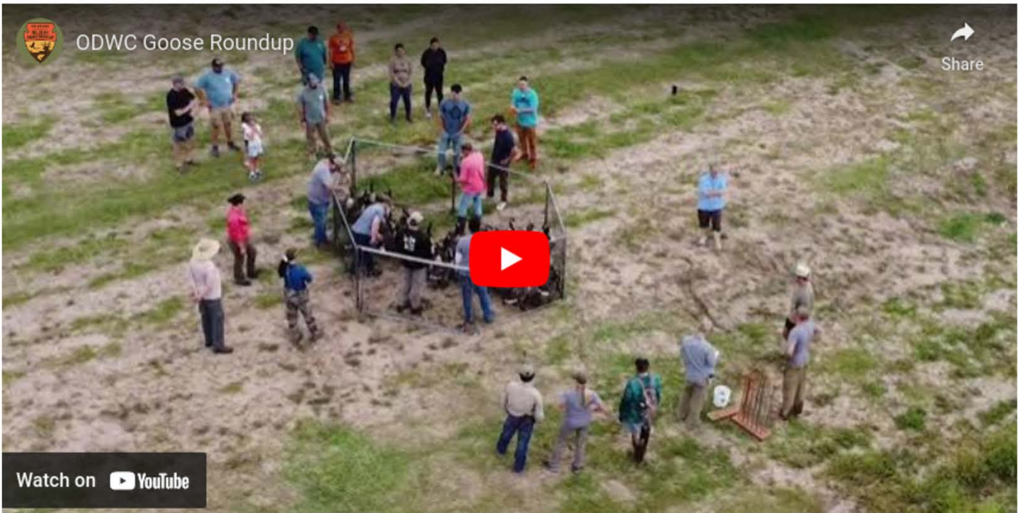
Drone coverage of goose banding 2024

Department employees wrap up 2024 goose banding. All four North American Flyways participate in banding projects to monitor Giant Canada Geese. Band return data from hunter harvested geese help give us an estimate of their populations harvest rate, mortality and movement across the continent. These metrics give us the tools to help determine how to best manage harvest limits and nuisance control efforts.