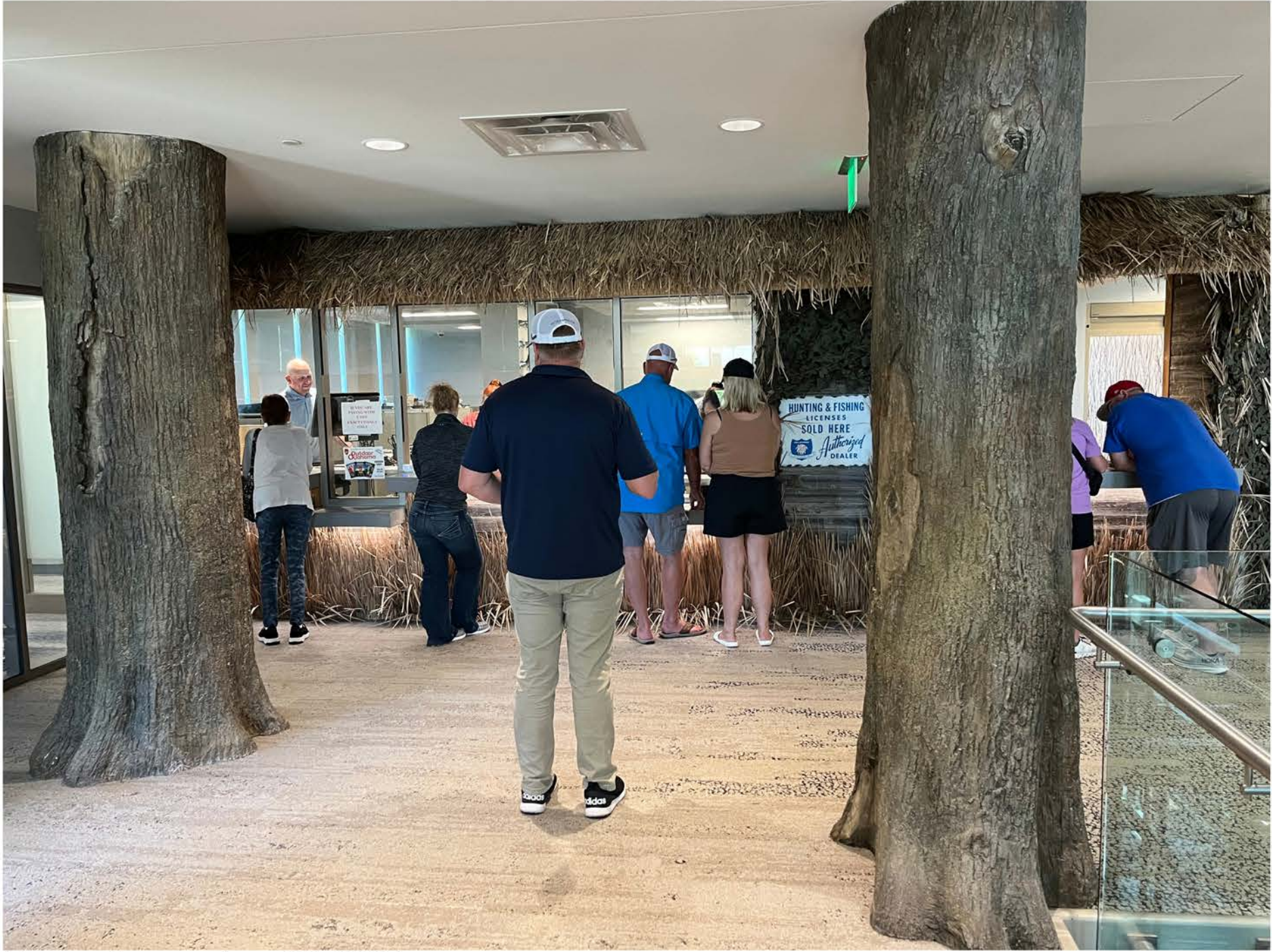
License lines on June 28, 2024.

During the last week, the average time from submission to approval was 1.2 hours. And during the final surge - June 28-30 - online approval time averaged less than 10 minutes.