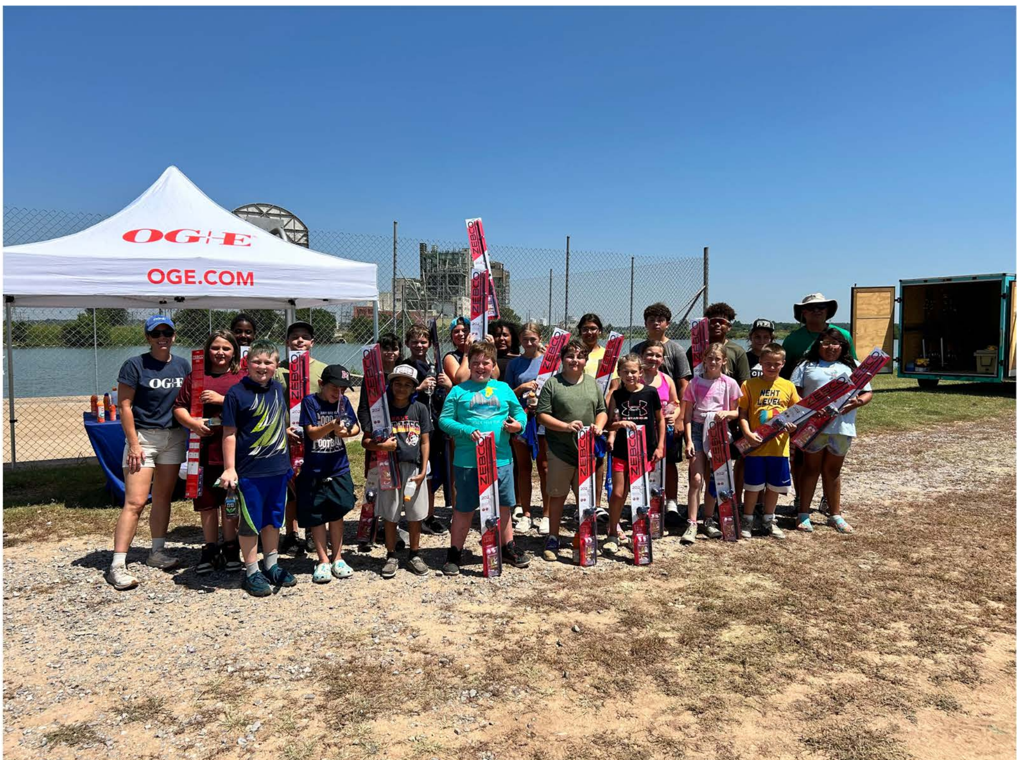
The children loved their new fishing poles!

This year we (ODWC) had the opportunity to team up with both River Valley and Horseshoe OG&E plant staff to host fishing clinics to use as community outreach projects. The River Valley OG&E clinic had an attendance of over 60 local summer school students in the LeFlore County area, while the Horseshoe OG&E clinic focused on close to 35 students from the Salvation Army Boys' and Girls' Club out of Shawnee. This was the first time for many of these students to ever fish and we are proud to have been a part of this opportunity. Our overall goal was for the kids to stay safe, have fun, and to catch some fish. We can absolutely say that we met our goal and are looking forward to continuing to team up with OG&E in the future!