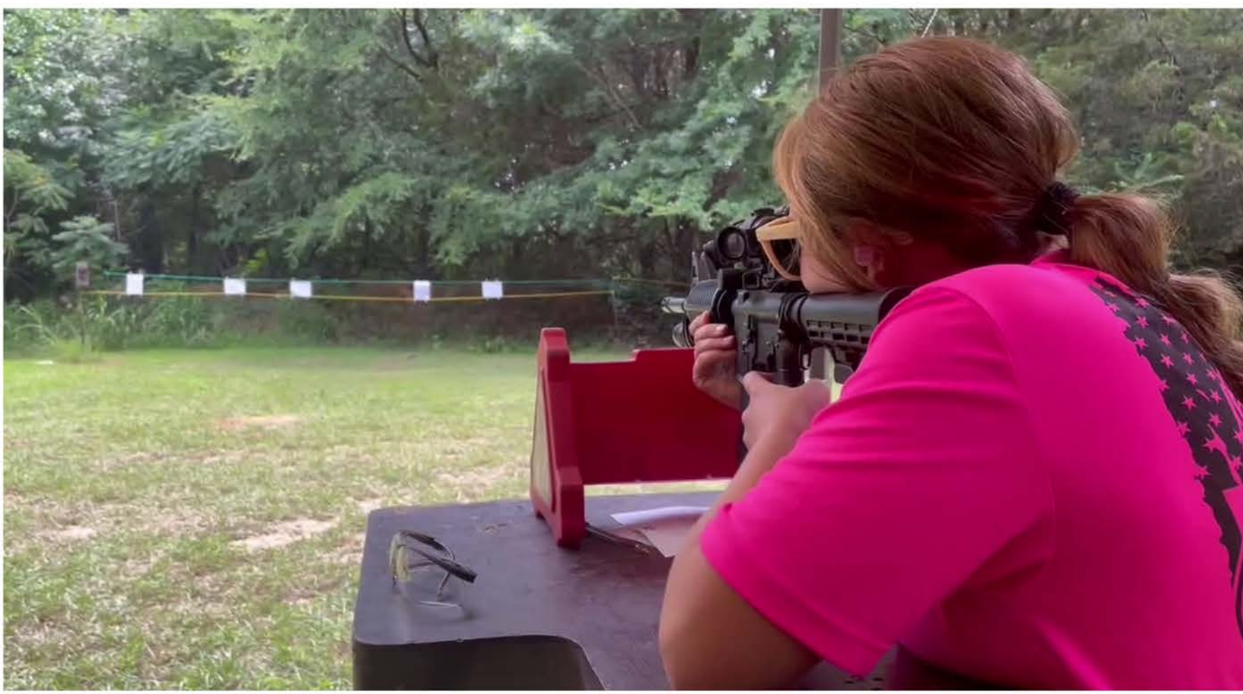
The kids had fun Learning to shoot M-4 and M-22s.