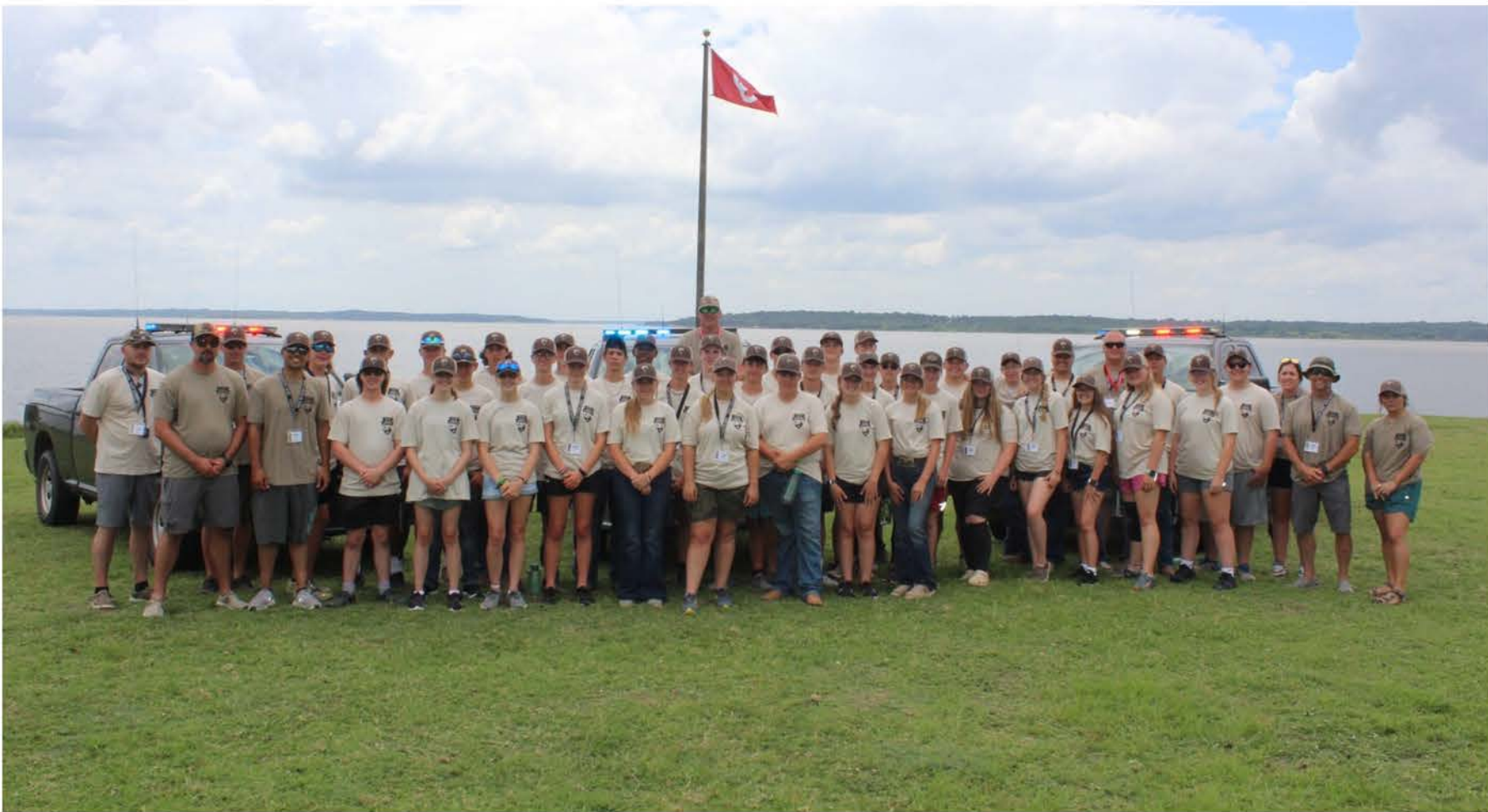
Huge shoutout to all of the ODWC employees who help make this camp a success.