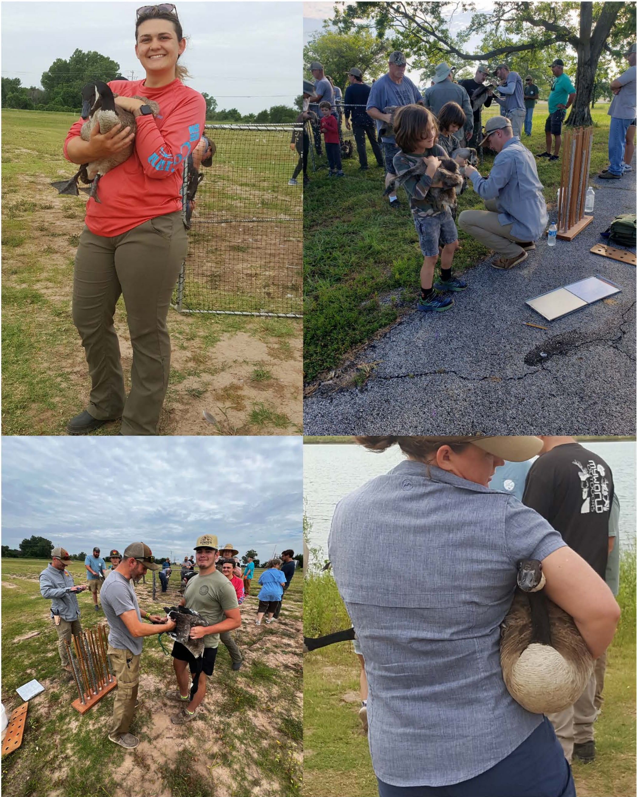
ODWC employees and friends joined together to help with banding.

Department employees wrap up 2024 goose banding. All four North American Flyways participate in banding projects to monitor Giant Canada Geese. Band return data from hunter harvested geese help give us an estimate of their populations harvest rate, mortality and movement across the continent. These metrics give us the tools to help determine how to best manage harvest limits and nuisance control efforts.