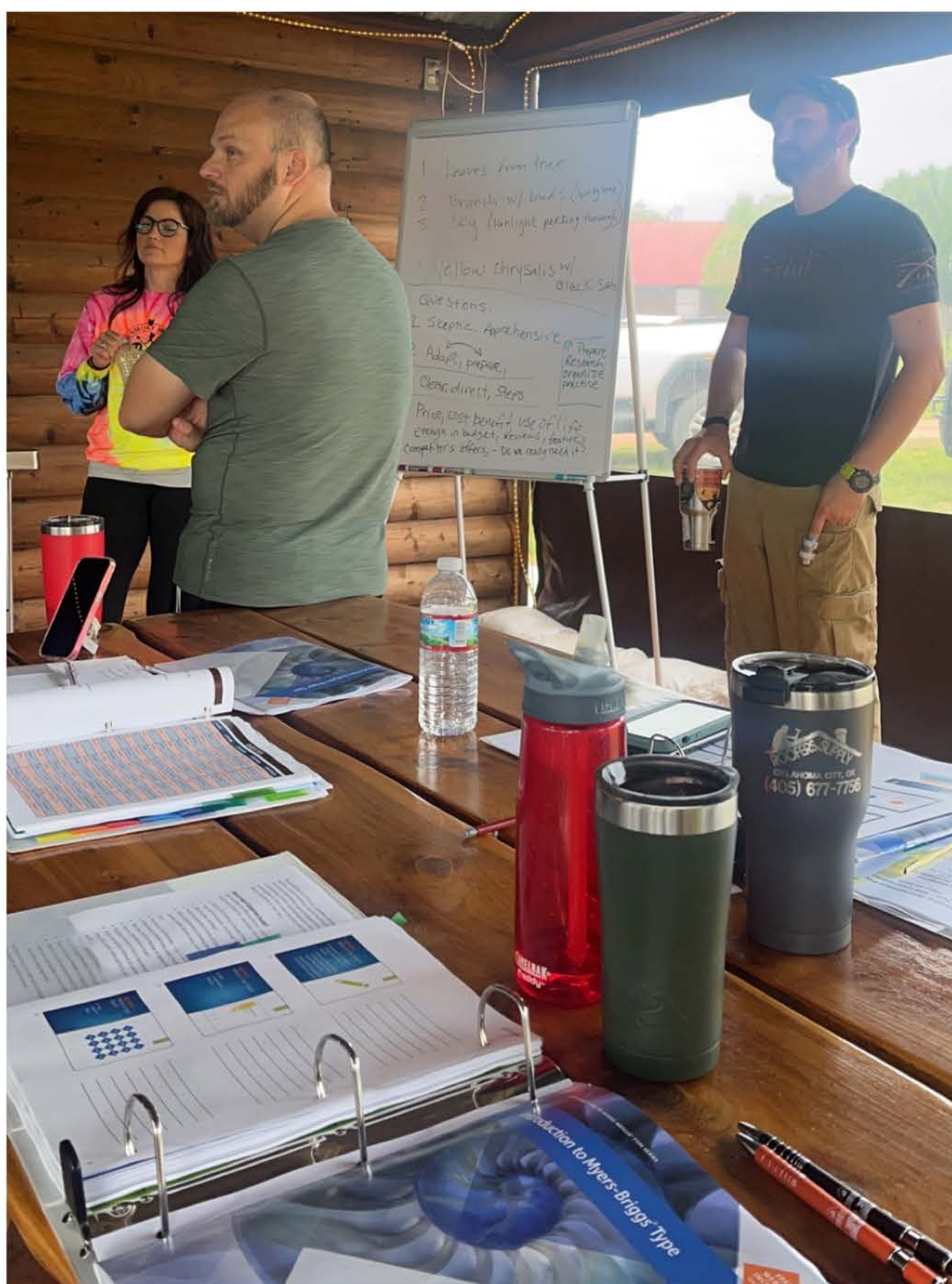
Group work is a great way to be exposed to a wide variety of perspectives and ideas