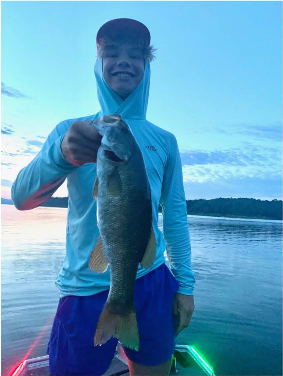
A fishing trip that will always be remembered.