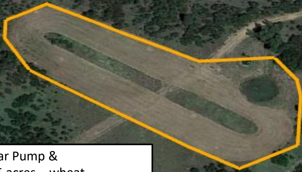
North Solar Pump & Wheat 1.5 acres – wheat