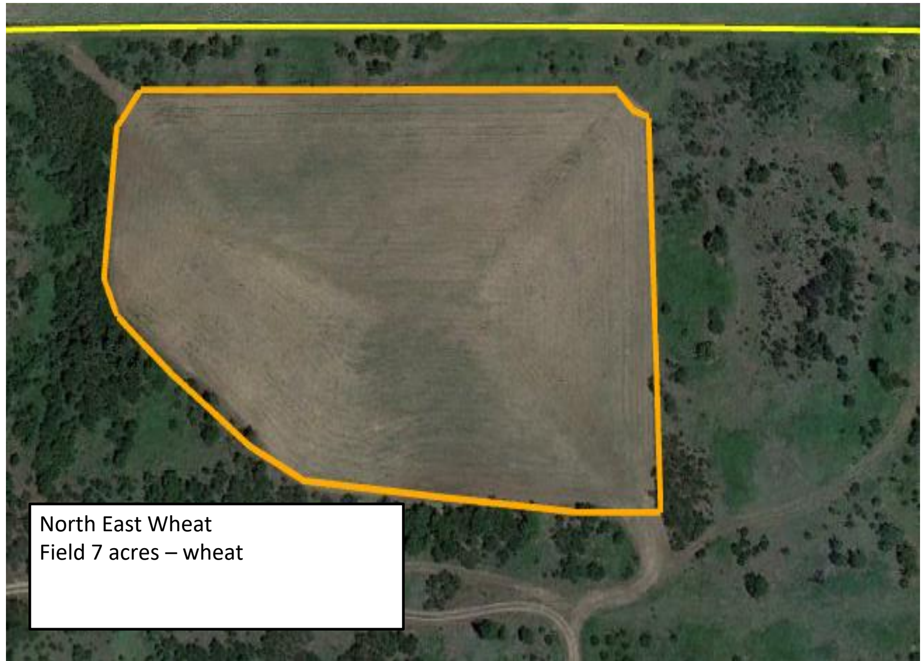
North East Wheat Field 7 acres – wheat